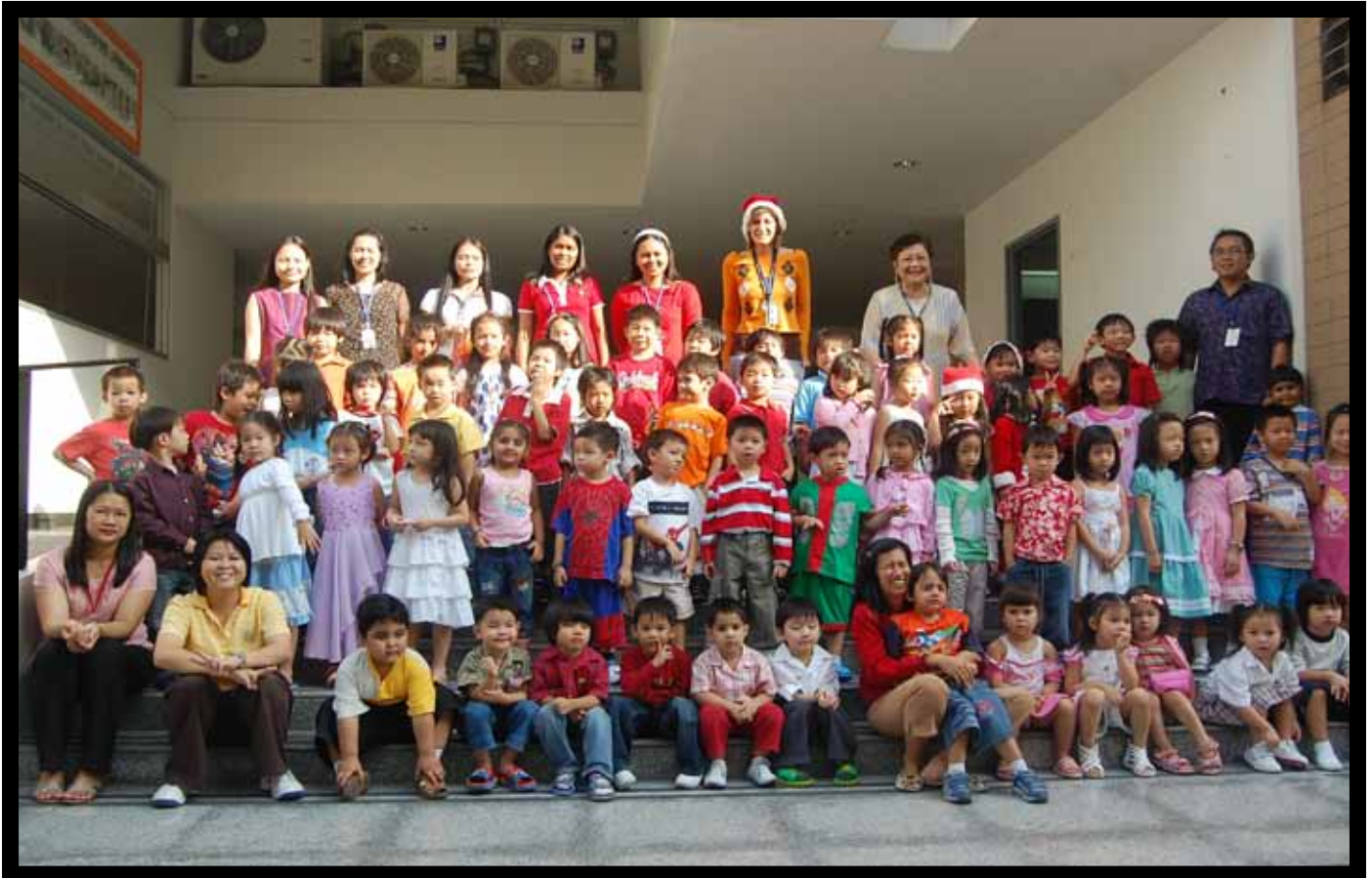
Students and teachers in the EIS Kindergarten Department during the Christmas celebration