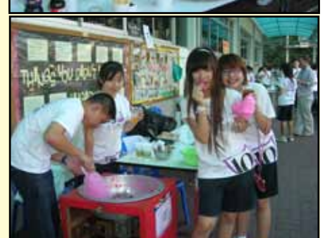
Young entrepreneurs showing their food booths, which include: buttered corn, meatballs "lookchin ping", french fries & chicken wings, fried Taro, happy egg, Mama noodles, nuggets, somtam & sticky rice, sushi, gyoza, kimbub, and toast