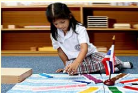
Pichya is developing her chromatic sense by working with colored tablets.