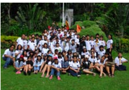
Group picture of the Grade 6 Pathfinders.