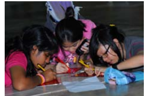
Students have to exercise patience in doing the Glass Etching Honor.