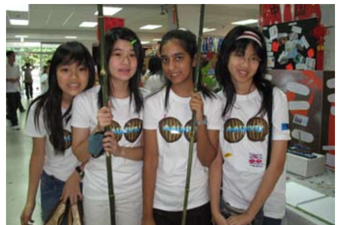
Grade 7 students representing Maldives..