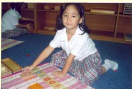
Montakam is practicing her math skills with decimal card system.