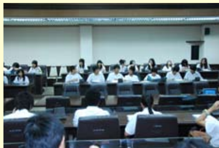
Students listening to lectures.