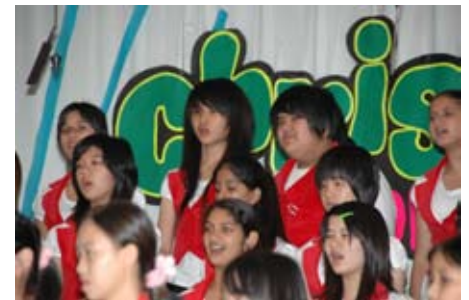
Grade 7 Choir Class.