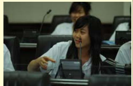
A student asking questions.