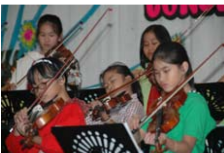
Grade 3 String Class.