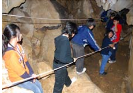
Caving is one of the exciting and memorable activities.