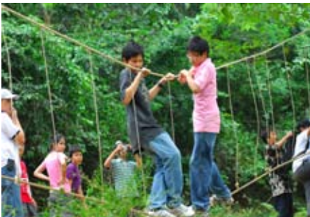
Obstacle courses test students strength.

“It gives youth an environment to actively expand their personal experience with God. They understand sharing, caring, helping others, and witnessing because they know what it means to be a Pathfinder.”