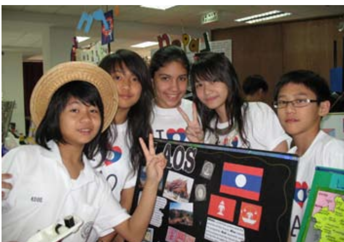
Grade 7 students representing Laos.