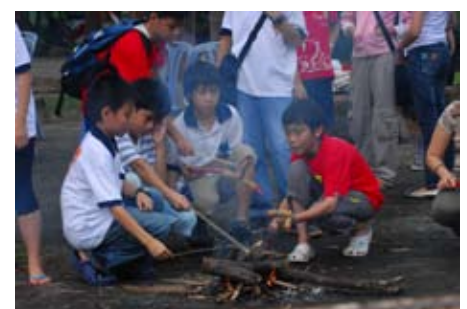
Smoke and heat make the bread yummy.