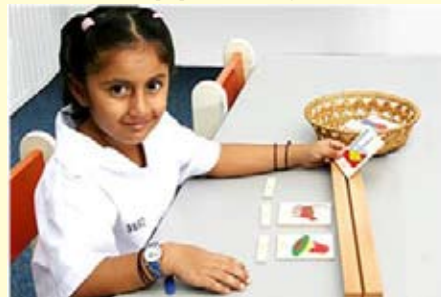
Mehaknaa is practicing reading with individual reading box.