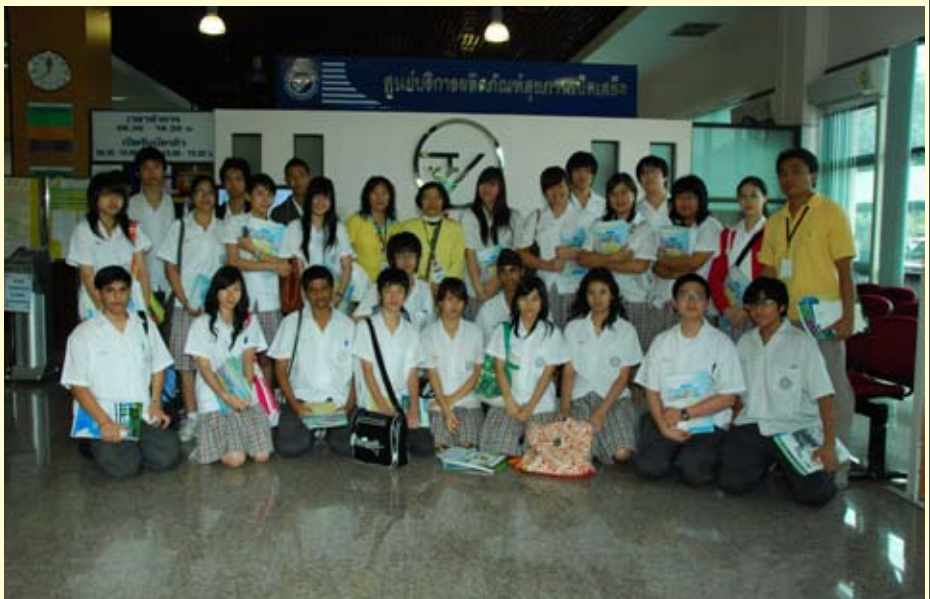
A group picture of the Health Class students at the FDA.

On November 10, 2008, students from the Health Class went for a field trip to the Food and Drug Administration of Thailand. The main role of the FDA is to protect consumer's health, to ensure safety, quality and efficacy of health products. These include food, drugs, psychotropic substances, narcotics, medical devices, volatile substances, cosmetics and hazardous substances available in the country. Personnel in the agency gave lectures and answered questions asked by the students. After the trip, the class realized the importance of the Food and Drug Administration for the welfare and safety of Thai people.