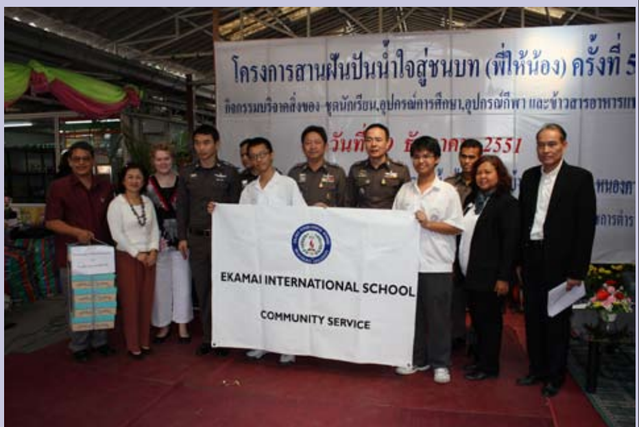
Students, teachers, and members of the administration, made a presentation of uniforms, shoes, and socks to the Police as a donation to the schools supported by the Border Police at the Klongtan Police Station, Bangkok.

We want to thank all parents, students, and friends who supported this worthy project.