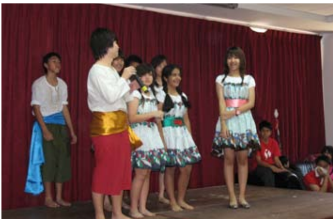
Grade 8 students are about to perform a cultural dance from Russia.