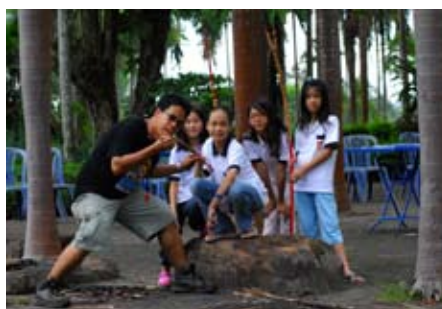
After making the camp bread, we have fun eating it.