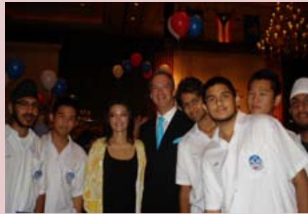
EIS students with the US Ambassador & his wife.

At the end of the day, the students learned invaluable facts about the US election process, the difference between Republicans and Democrats, who the presidential candidates really are, and the power of democracy.