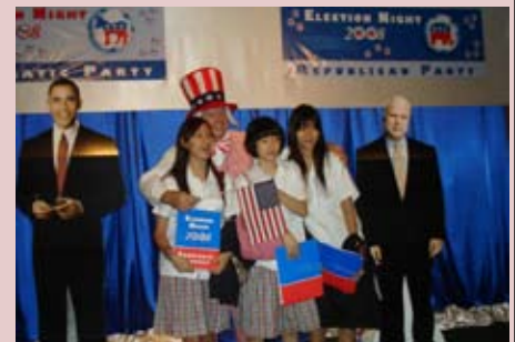
Students standing with the MC and life-size cutout of Mr. Barack Obama and Mr. John McCain.