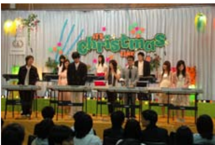
Grade 7A & B Keyboard Class.