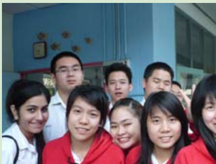
Student volunteers ready to help.

Later, the seniors were divided into two groups. The boys cleaned the basketball court with soap and water while the girls interacted with mothers who were often only children themselves. Our students came home sober and tired, but happy that they were able to bring some small amount of cheer to those in need.