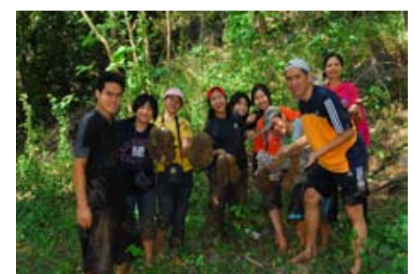
After the hike to the cave, our shoes were full of mud and we were soaking wet.