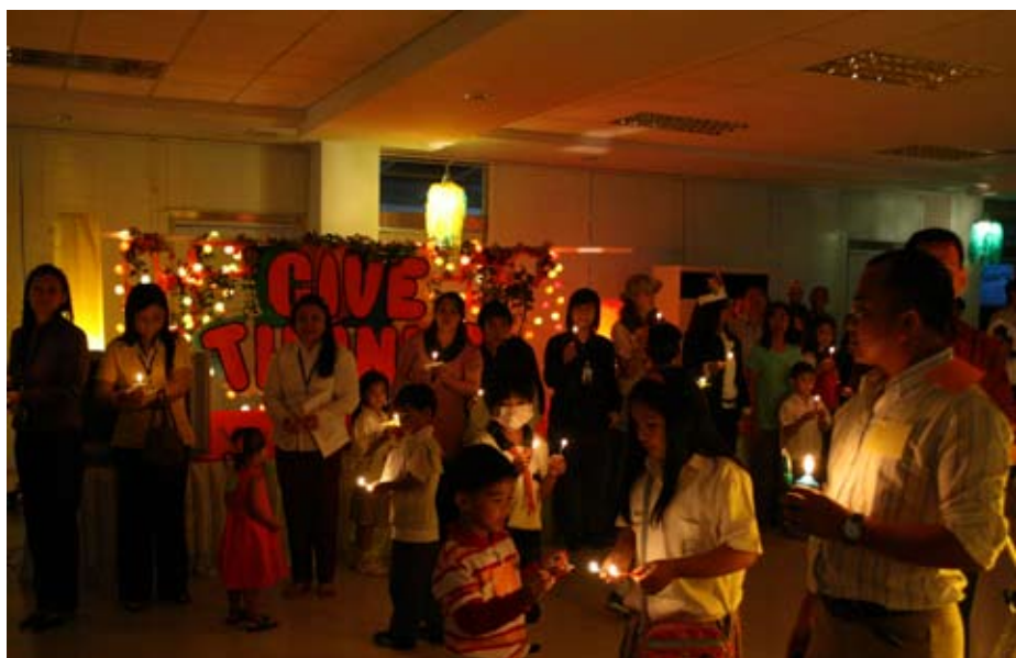
EIS family during the Candle light ceremony.