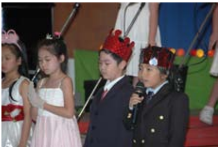
Grade 2C Music Appreciation.

Below are pictures of students doing their performances in singing, organ, flute and violin playing from Grades K - 8