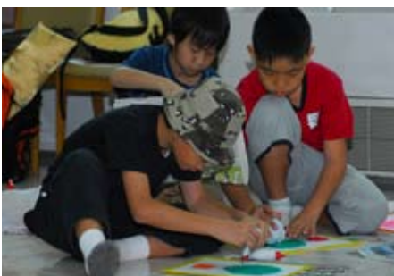
Students need to use their creativity in completing the Sand Art Honor.