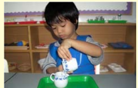
Chanonth is doing practical life exercises to develop hand and eye coordination and concentration span.