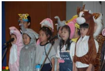
Grade 1B Music Appreciation.