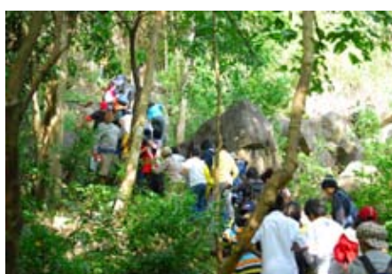
We were walking on the trail to reach the cave.