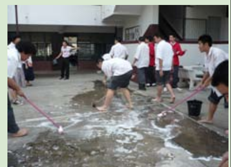
Students helping to wash the basketball court.