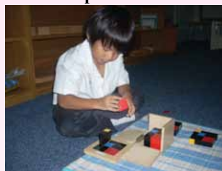
Parin is using his logic to figure out how to put trinomial cube back together.