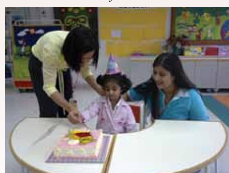
Celebrating a Birthday