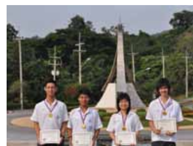
Cover Picture: EIS students standing in front of the Asia Pacific International University landmark with their winning medals and certificates. (Page 9)