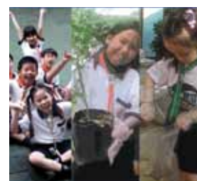
(Cover Page) Adventurer Club members doing activities during Adventurer Week. See Page 6.

We offer a challenging, Christ-centered academic program and the opportunity for students to exercise and expand their varied abilities and potential. We endeavor to create a climate marked by a sense of God’s presence and action in the world, love for one’s neighbor and concern for social justice and equality for all people.