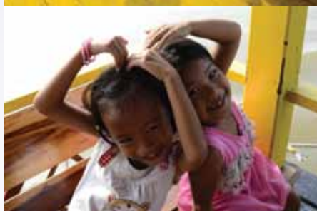
(Left and Above) Care Quest Club members with school children at the Baan Pee Sorn Nong.