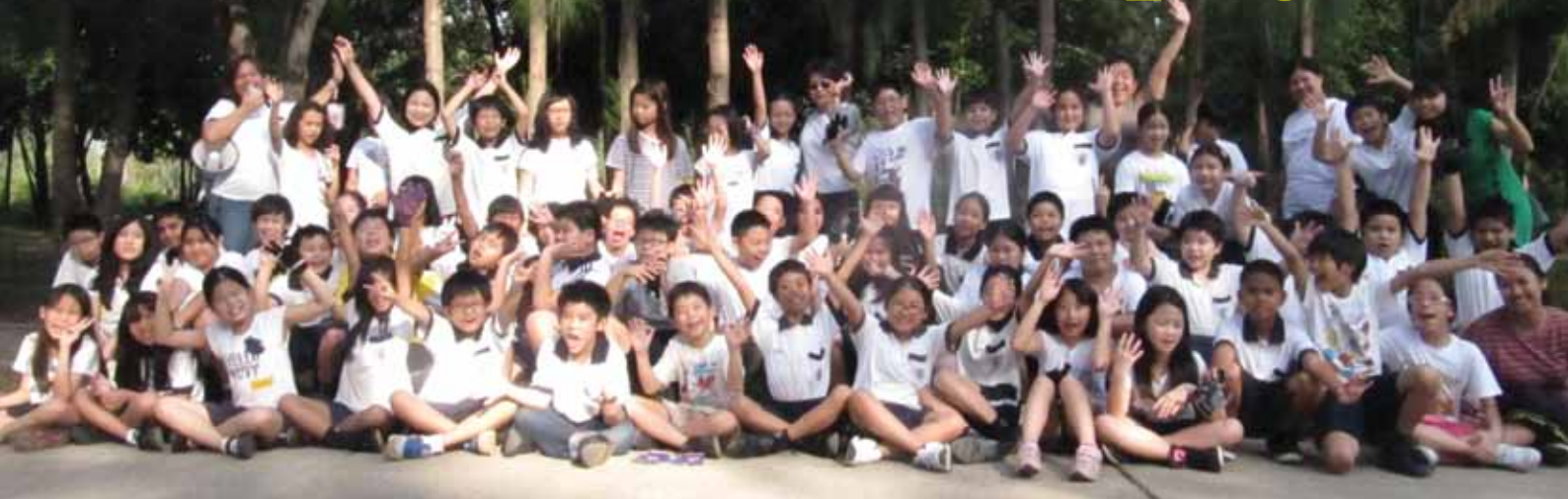
(Above) Students from Grade 4 enjoy camping at the Pines Resort in Pathumthani. (Below) Students are enjoying various activities at the camp.