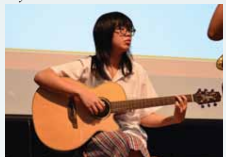
A High School student is accompanying the song service with her guitar.