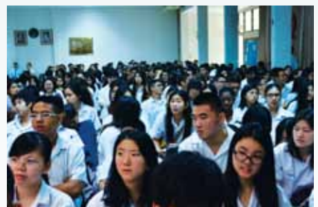
High School students listening attentively to the speaker.