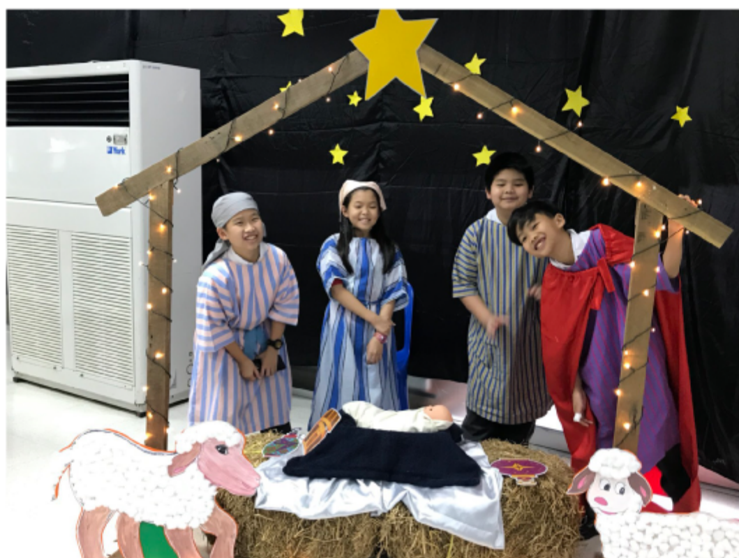
By Verlinda Quimba, IEL 2 Teacher

T he show is very impressive," said one parent; "I like the show, it is very nice," as another parent commented. These were just two of the numerous comments that IEL parents have shared after the 2017 Year-end Program for the IEL Department last December 10, 2017.