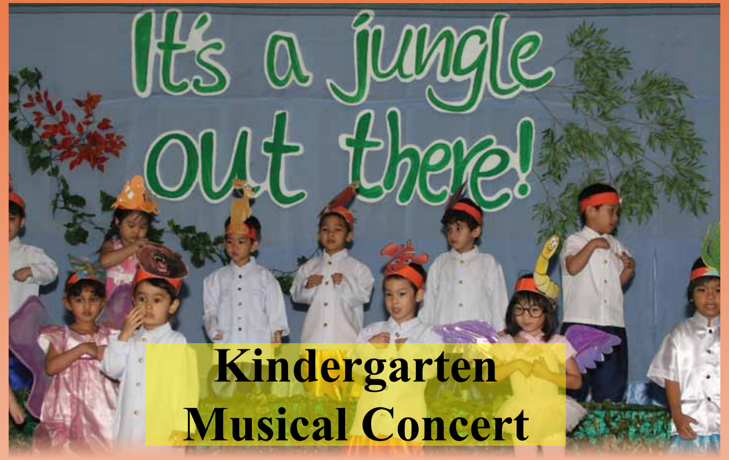
K3A students wearing animal hats are performing an action song.