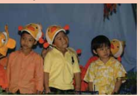
K3B students wearing fish hats performing an action song.