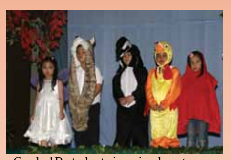
Grade 1B students in animal costumes.