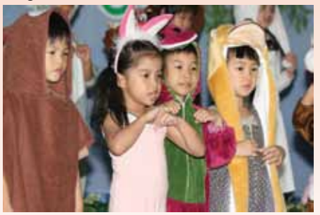
K2A Students performing an action song.