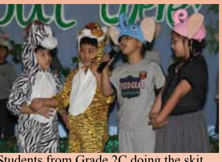
Students from Grade 2C doing the skit about King Leo.

"These children are the focus of our daily lives," said another proud parent. "We enjoy being part of their school life."