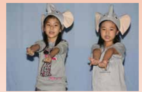
Grade 1C students performing as Elephants.