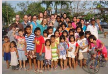
Group photo with children in the community.