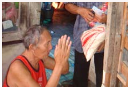
Delivering rice and other food to the homes.