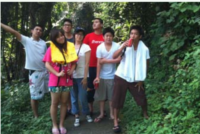
EIS students with members of the Grace Adventist Center on a hike to a waterfall.