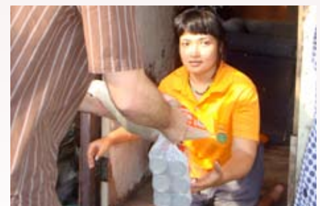
A grateful lady receiving food items.