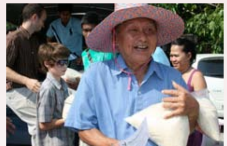
A happy man, delighted to receive the rice bag.