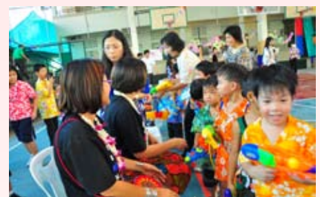
Students from the primary class also participated in the ceremony.