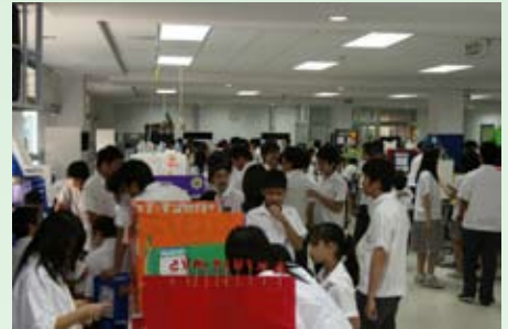
Many eager students visiting the booths.