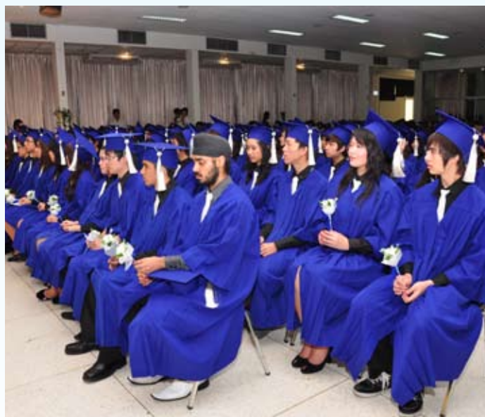
Graduating class paying close attention to the speaker.