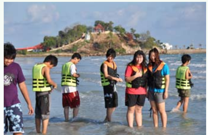
Students enjoying a trip to the beach and nearby island.