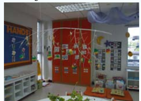
Another scene from K3A classroom