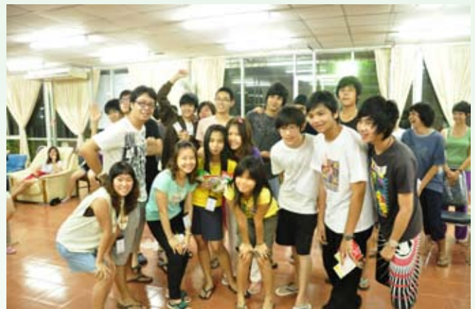
EIS Side by Side camping with members of the Grace Adventist Center.