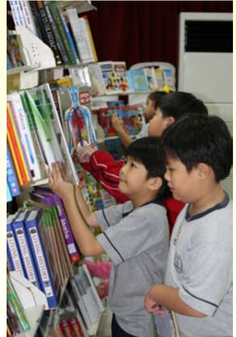
Students are looking for books to purchase for their book reports.