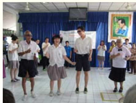
Papada and Ghan are having a good time dancing with the elderly.