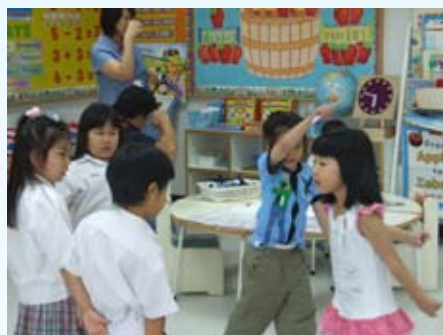
Children enjoying playing games while waiting for their parents.