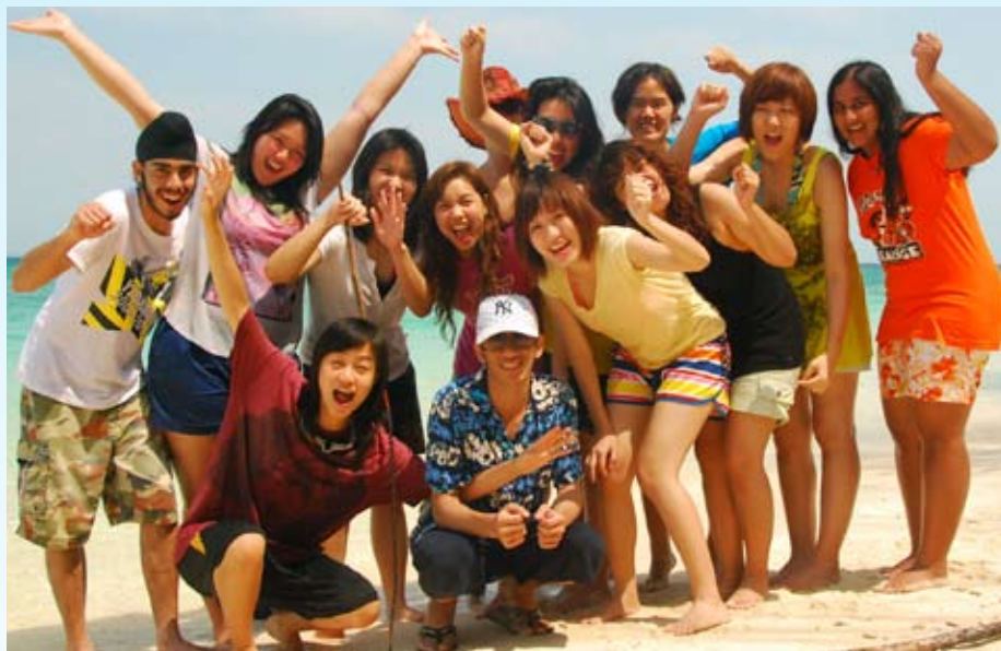
A group of seniors enjoying themselves during the excursion.