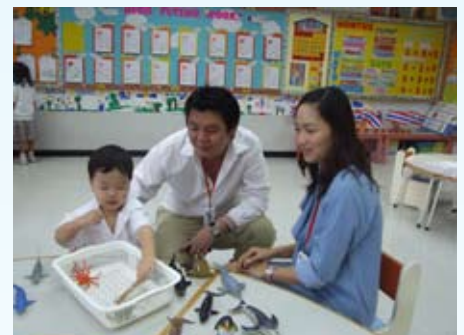
A K1 student is showing his parents something that he has learned in class