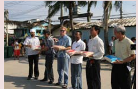
Handing ceremonial rice to the leaders of the community.