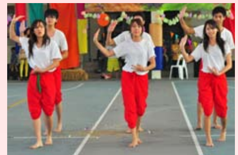
Cultural folk dance presented by middle school students.