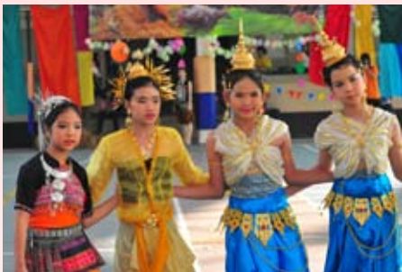
The beautiful Thai dance from the four regions of Thailand.