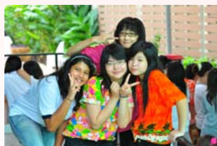
Happy celebrants welcoming the Thai New Year.