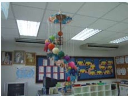
A well decorated K3A classroom