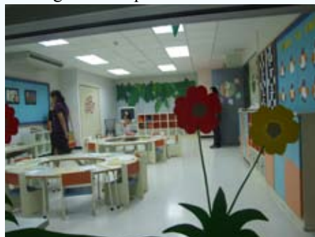
A parent admiring artwork by students in K2A classroom.