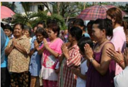
Prayer and blessing on the community before the rice distribution starts.