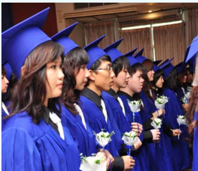
Graduating Class stood at attention for the King's anthem