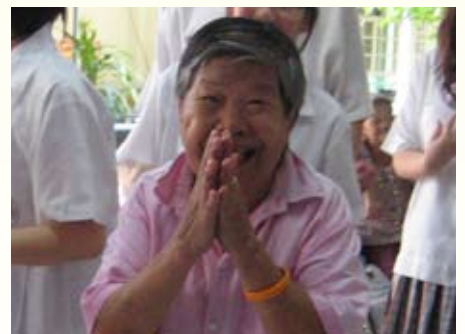
A grandma said "Thank you" to all the members of the F2F for visiting and entertaining the folks at the Home.