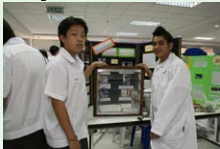
Automatic Slated Window