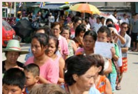
People lined up by families to receive the rice.