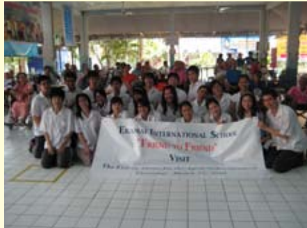
A group picture of the Friend to Friend Club (F2F) who visited the home for the elderly.

Members not only enjoyed the time together, they could also see the joy and happiness on the faces of the elderly. They really appreciated our help and kindness and realized that only a little amount of time that we can give may be the most memorable moment that they will never forget. The Bible says, "Honor thy father and thy mother: that thy days may be long upon the land which the Lord thy God giveth thee. (Exodus 20:12)"