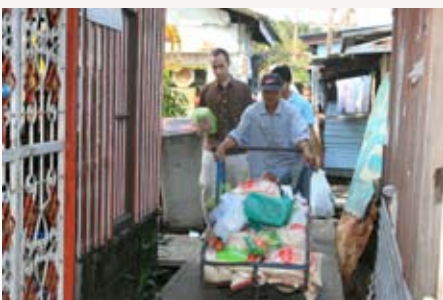
Taking rice to those who could not leave their homes.