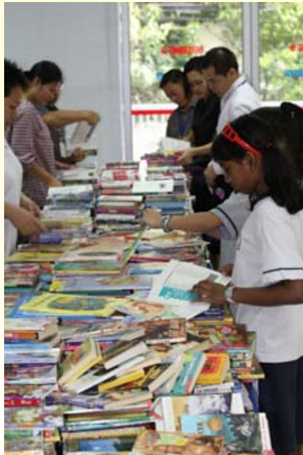
Students and teachers eagerly browsing to purchase second hand books.