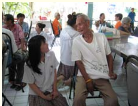
Papada is being a good listener for the elderly.