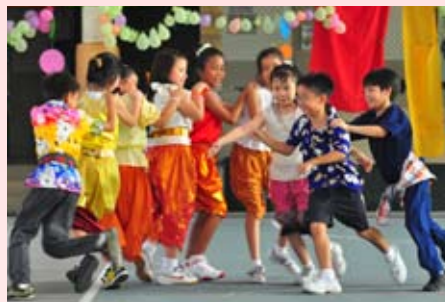
Students playing the Thai traditional game.