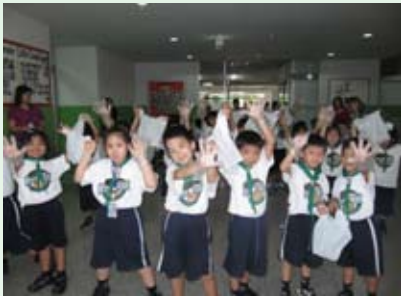
K1 & K3 Students picking up trash

The Adventurer Week was a new and exciting experience for the club members and it has impacted on their learning experiences, their lives, and the lives of many others. Their acts of kindness will always be remembered.