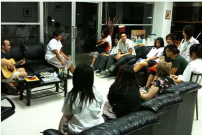
Fun group discussion on TGI Friday