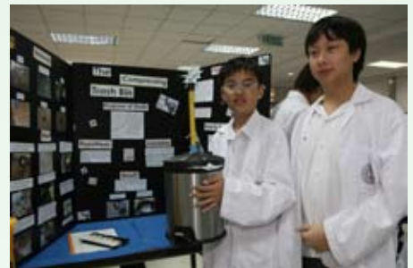
Compressing Trash Bin