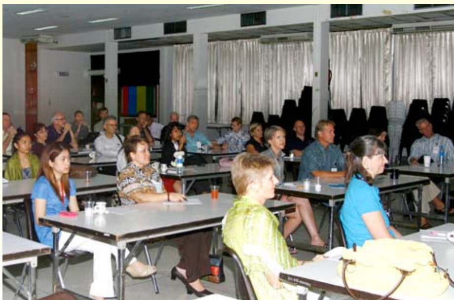
Some of the delegates from various international schools in attendance

In the afternoon session, delegates shared useful information about colleges and universities in Thailand and abroad.