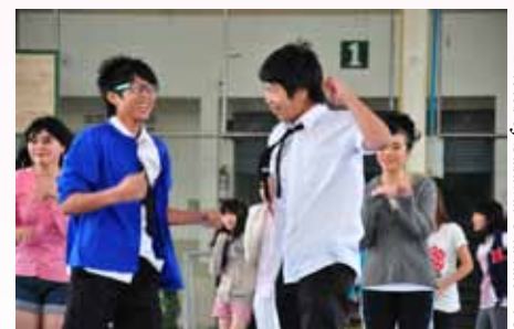
Modern Dance by 8D students