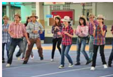
Cowboys Dance by 8E students