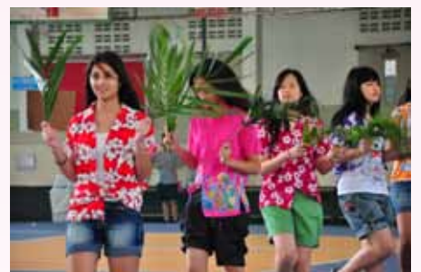
Coconut Dance by 8B students