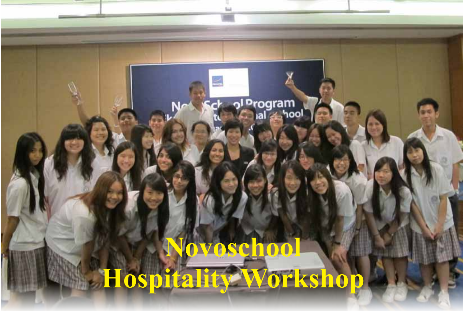
General Business students who attended the Novoschool Hospitality Workshop at Novotel Hotel.