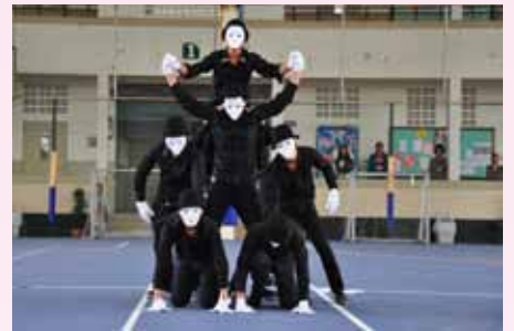
Robot Dance by 8G students