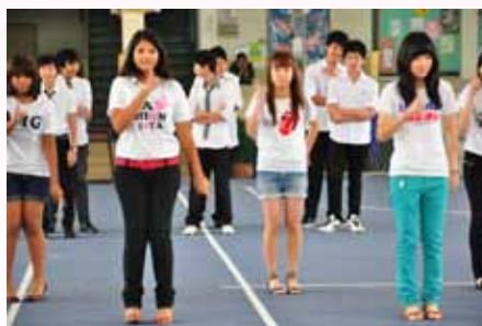
Tribe Dance by 8A students