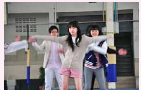
Korean Dance by 8C students