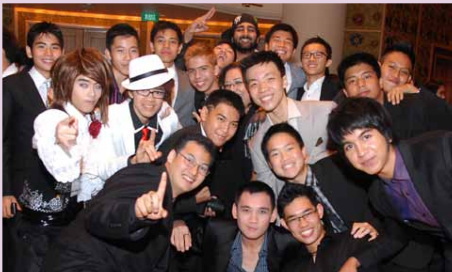
Some of the handsome young men of the evening.

Photo-taking was in every corner of the room. Flashes and shutter sounds were