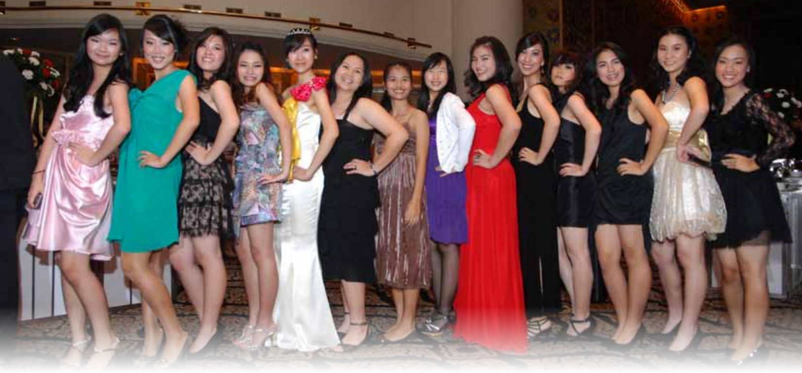
Some of the beautiful young ladies of the evening.

By Nuttawat Vangsundaraporn 11A and Kittapong Wu 11B