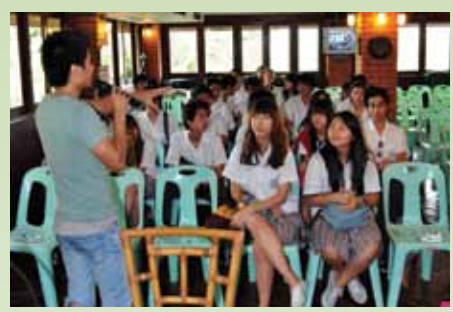
Instruction is being given on arrival at the camp.