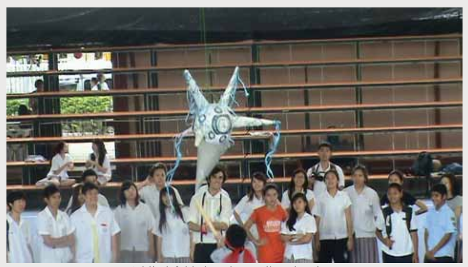
A blind-folded student strikes the piñata.

A competition was organized for Primary Level students to paint a piñata, which is a gaily decorated papier-mâché figure filled with toys, candy, etc., and suspended from above, especially during festivities, so that children, who are blind-folded, may break it or knock it