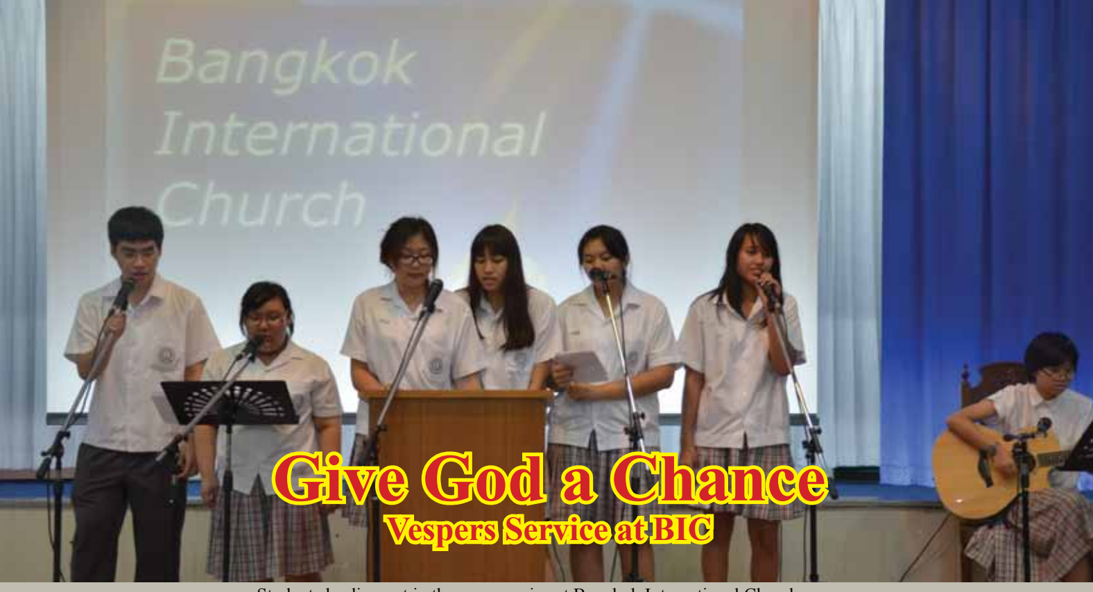
Students leading out in the song service at Bangkok International Church