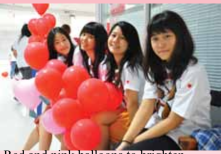
Red and pink balloons to brighten everyone's day!

A teacher said, "I observed and felt the sweet and loving attitude that members of our EIS family have towards one another. However, it would be even better if these attitudes could be manifested everyday of the year!"