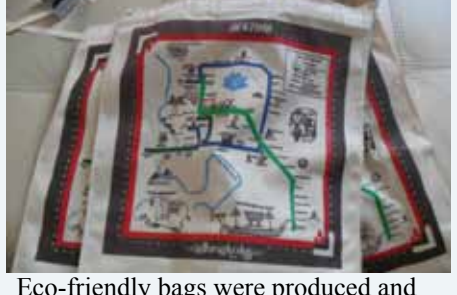
Eco-friendly bags were produced and sold to tourists by the EIS Team.