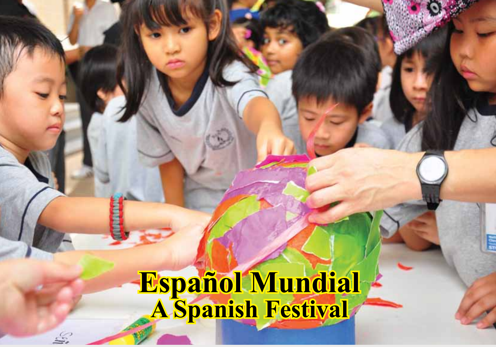
Primary students are decorating a piñata.