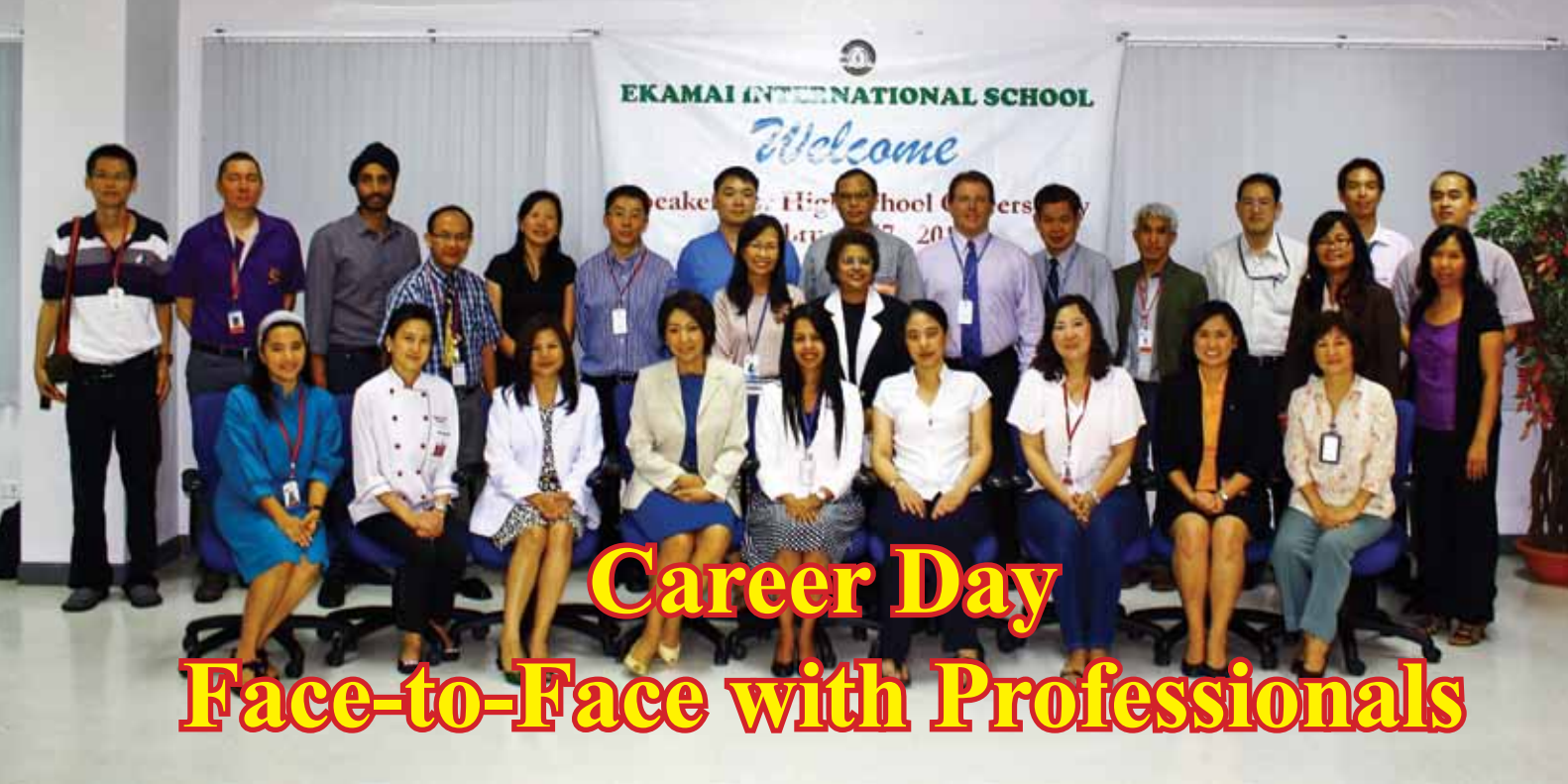
Distinguished speakers for Career Day included alumni, parents and invited guests.