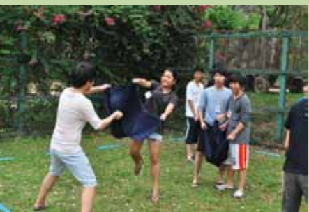
Students are having fun playing water balloon volleyball.