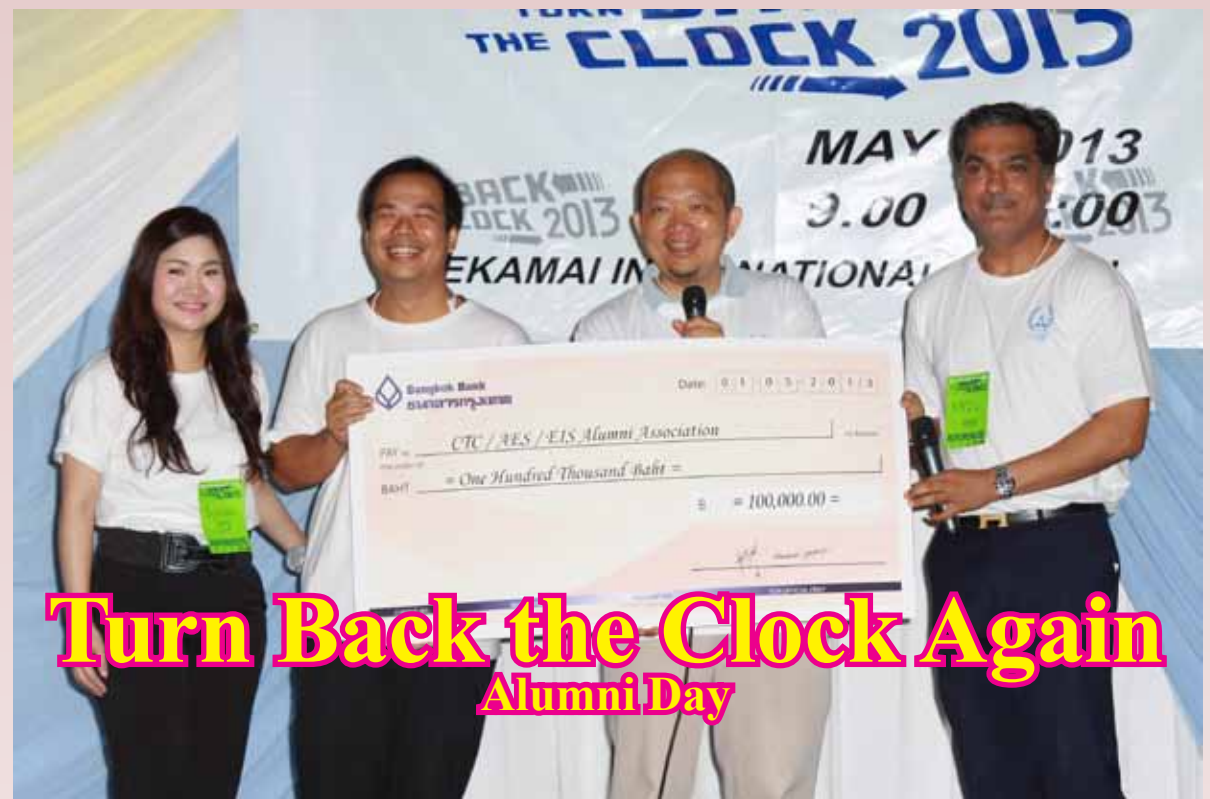
The EIS Alumni Association raised Baht 100,000.- for the beginning fund of the newly founded Alumni association. (Below) Alumni are having fun playing and socializing together.