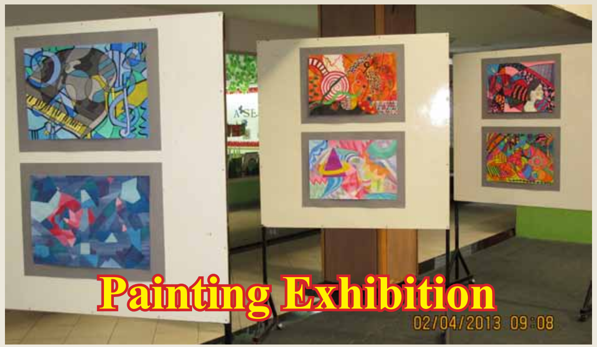
Art work by students on display in Building 9