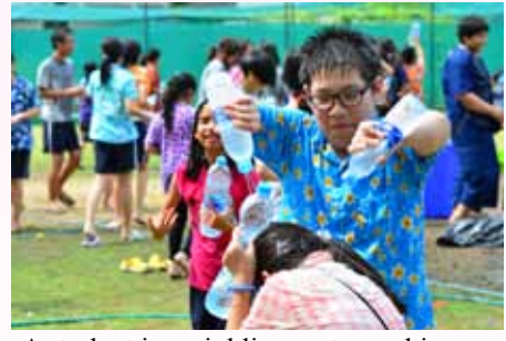
A student is sprinkling water on his friend.