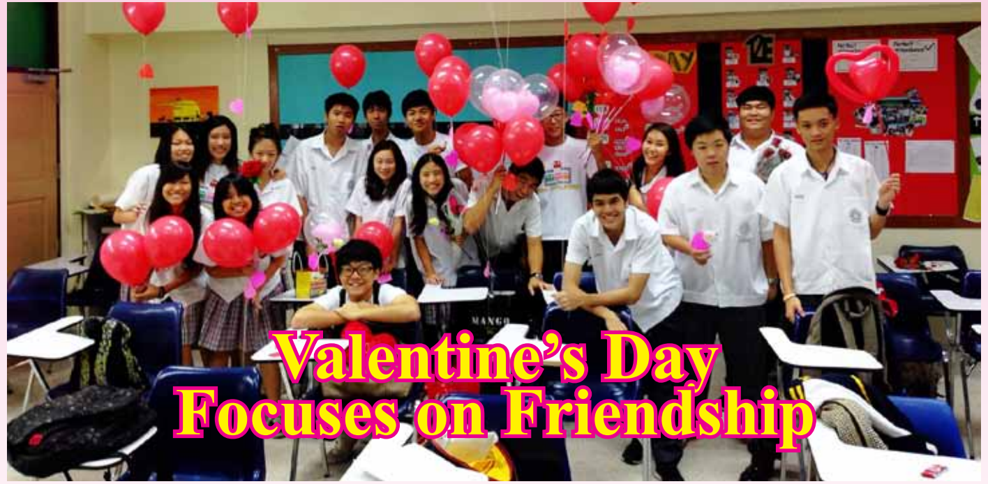
Students enjoying the Valentine's Day in the classroom.

alentine's Day came again to EIS on February 14th. It started, of course, with sweet surprises and ended with a spectacular bang. Once only famed for lovers, this year the EIS event focused heavily on showing appreciation to friends.