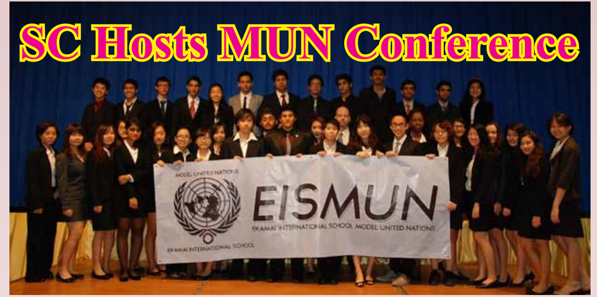
EIS delegates to the Ekamai International School Model United Nations.