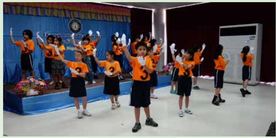
(Above and below) Glittering variety shows by the primary students and exhibition booths by various classes.