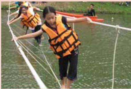
Pathfinders test their courage by crossing a river with a rope bridge.

On February 19, 2014, the Grade 5 Pathfinders went on a camping trip to Wang Dum Mountain Camp in Kanchanaburi.