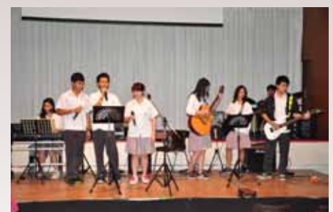
Students are leading out in the lively song service.