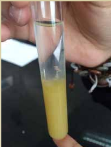
The DNA could be seen coming out from the kiwi juice.