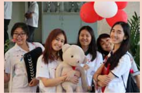
Love is in the air for these Senior students as they share the joy of giving.

It was late afternoon on Wednesday, February 12th, 2014 when Juniors hurry up to prepare for the much anticipated Valentine's Day at EIS.