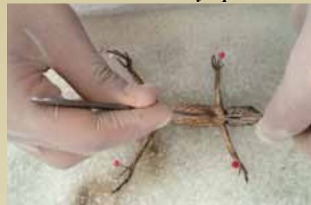
The anesthetized garden lizard is about to be dissected.

By Nalinwara Pattara-angkoon 9B and Natnicha Imamnuaysup 9E