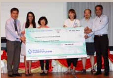
EIS Administration (1st-3rd from left) received a check of Baht 80,000 from the CAE Alumni Association.

Nostalgia was plentiful, but so was alumni generosity. CAE donated Baht 80,000 for the development of EIS.