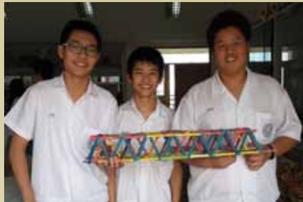
The students with the strongest bridge that can support 111 kg of weight.

For the third quarter of school year 2013-2014, students from Mr. Felix's physics honors class had to construct bridges that were strong enough to support a great amount of weight.