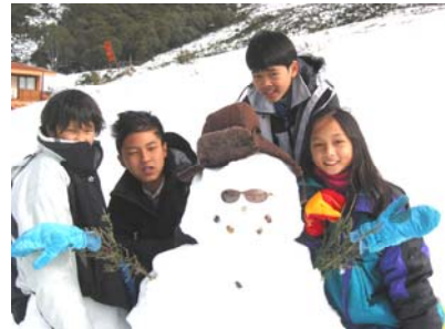
Students making a snowman.

This is one of the best ways for Thai children to expose themselves to western culture and practice English with native speakers at the same time. I am looking