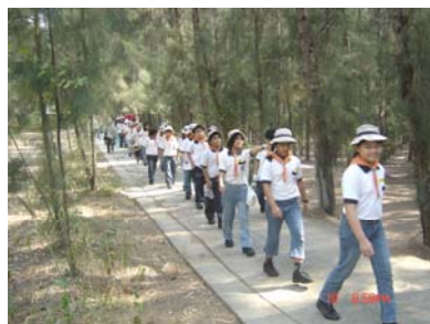
Adventurers on a hike