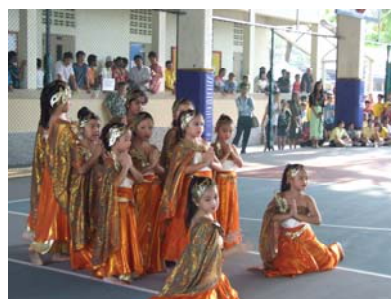
Young Thai dancers