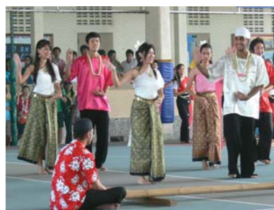
Thai Bamboo Dancers