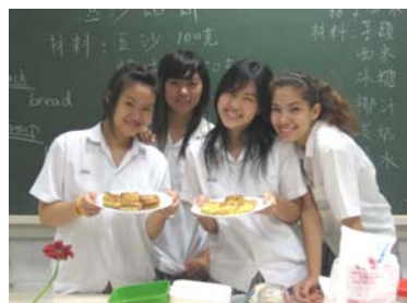
EIS students demonstrating Thai cooking