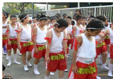
Junior Thai boxers of EIS