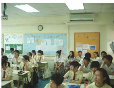
EIS Students attending regular classes in Hong Kong

Eight students joined the Cultural Exchange program in Hong Kong last summer and visited the Tai Po Sam Yuk Secondary School. It was a combination of cultural exchange and sightseeing. Students enjoyed the hospitality of the teachers and students in that school. EIS students presented Thai cultural dances and sang Thai songs in their chapel program. It was an experience that they will never forget. We want to invite more students this coming summer to visit another country. ■