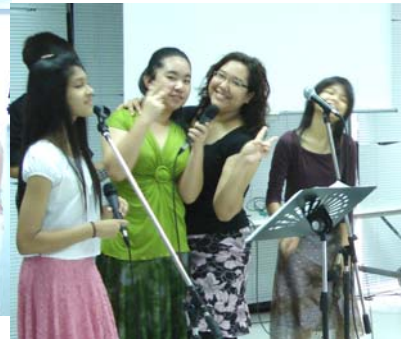
The Praise Singers leading the song service