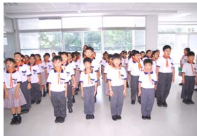
Adventurers waiting for command