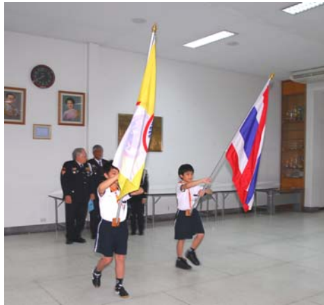
Students carrying the Adventurer flag and the flag of Thailand