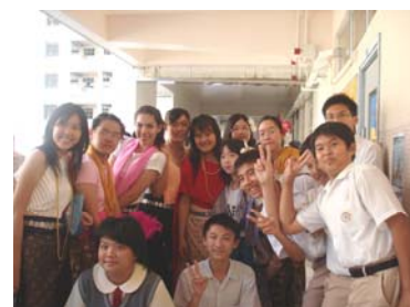
EIS students with students from Hong Kong