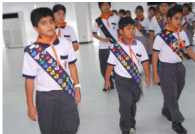
Adventurers displaying their honors