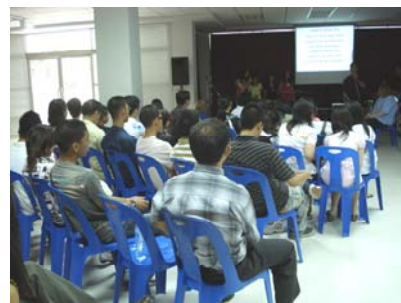
Students listening attentively