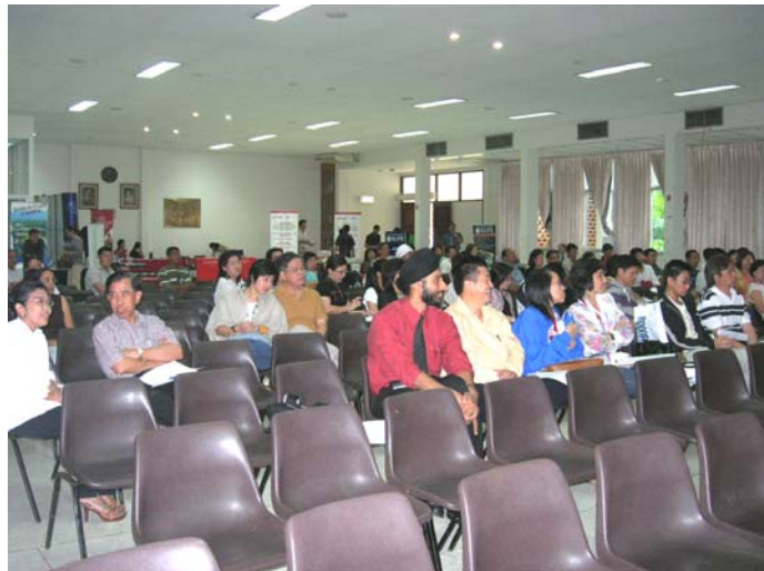
Parents listening to the seminar