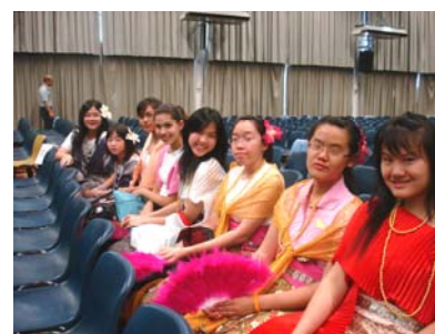
EIS students were about to perform a Thai folk dance