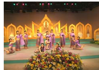
Cover Picture: EIS students performing a Thai dance at TV Channel 5

Email: newsletter@eis.ac.th Tel: 0-2381-9303-7, 0-23913-593,6 Fax: 0-2381-4622 Website: www.eis.ac.th