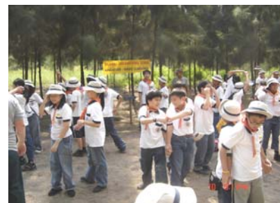
Adventurers having fun at a camp-out