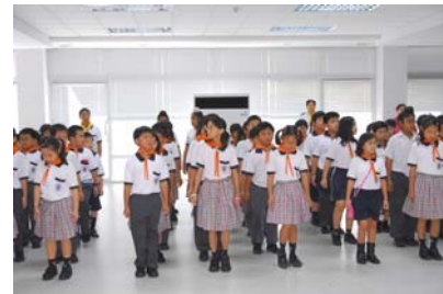
Adventurers waiting for command