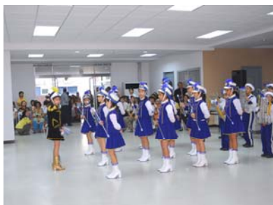
Adventurer Club Band