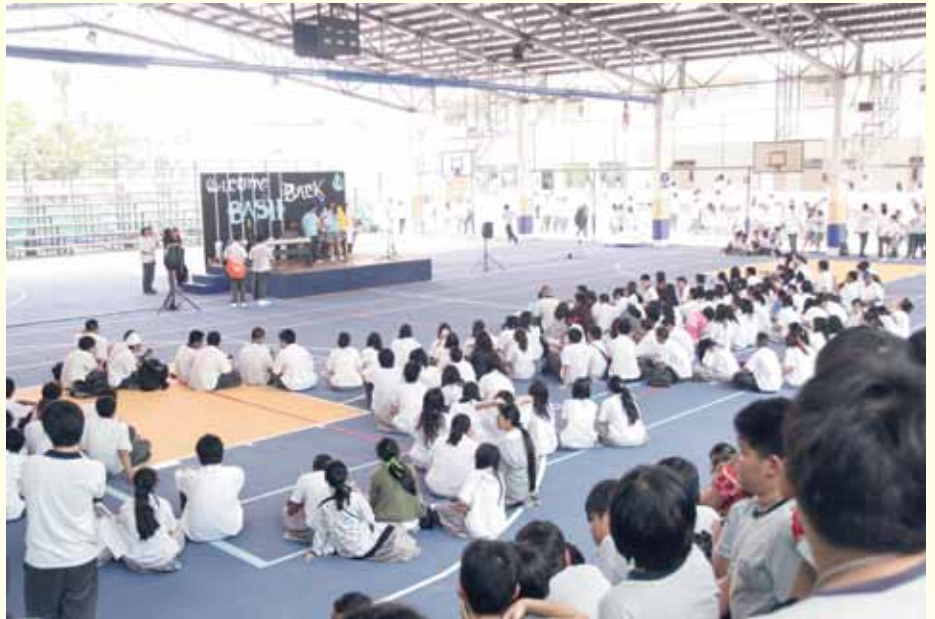
New and returning students gathering at the covered court are being welcomed and entertained by the Student Council.

Welcome Back Bash has become a tradition at EIS. It provided students with memories and created a bond for students from various grades.