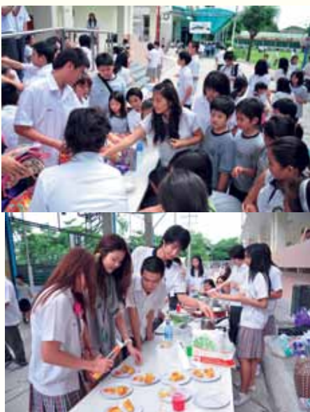
(Top two pictures) Students were flocking to buy food prepared by students to raise fund for their classes.