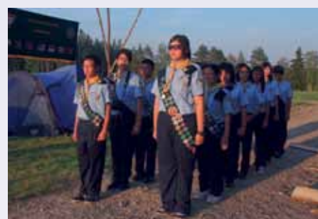
EIS Pathfinders ready for action.

From Tuesday until Friday, the Pathfinders were busy learning new honors, trading pins, watching competitions, trying out new games and skill and many other "cool" activities to keep everyone busy. Each day was filled with endless activi-