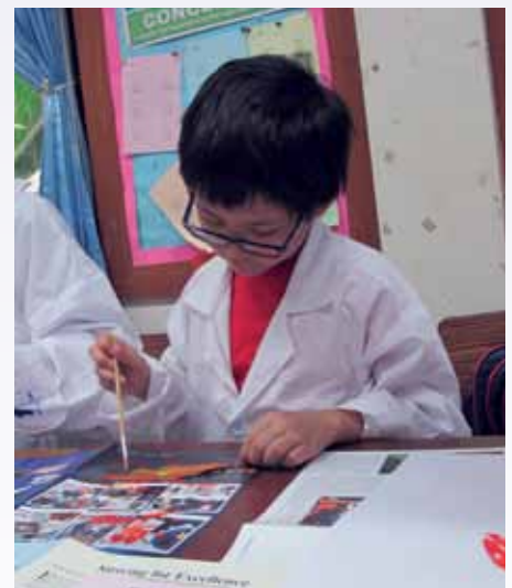
A student is doing some painting.