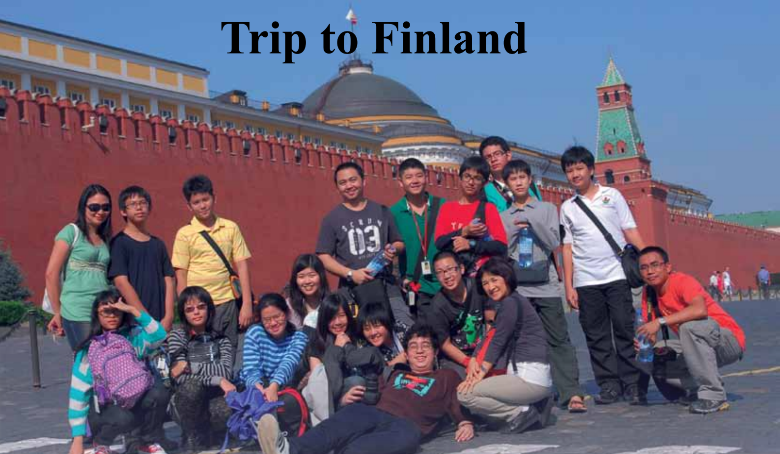
EIS Pathfinders and teachers in Moscow, Russia.