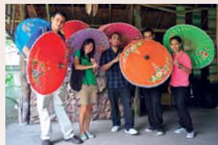
Teachers trying out the Thai traditional and colorful umbrellas.