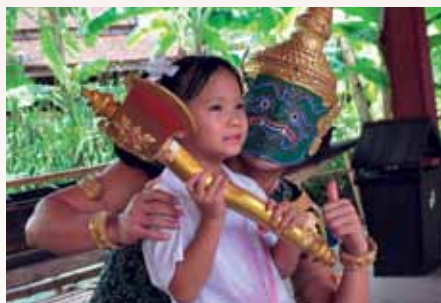
A primary student holding the "weapon" of the "devil."