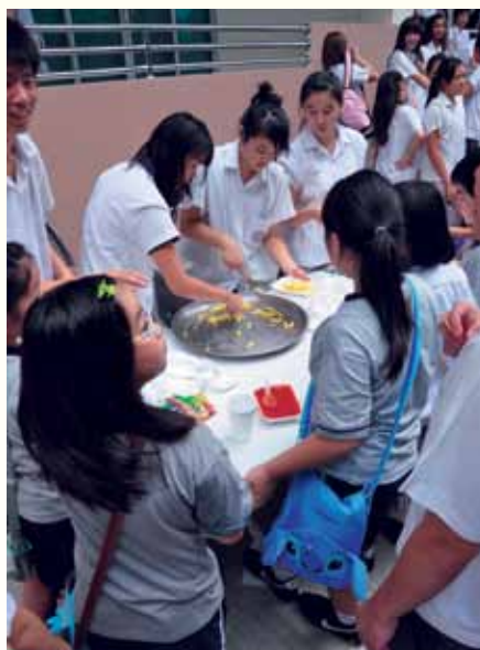
Many students are disappointed when the food ran out, but happy to be back at EIS.