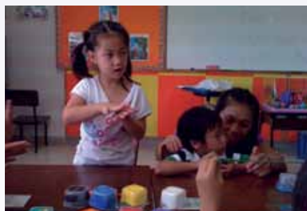
Students making cakes with clay dough.