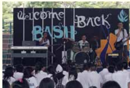
A musical band is entertaining the students.