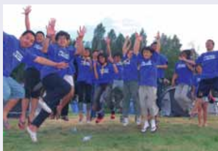
EIS Pathfinders at the campsite, jumping for joy.

Later we took an hour's trip by the cruiser Superstar to get back to Helsinki where our group stayed for the next three days before proceeding to the campsite. In Helsinki, the weather was very chilly but sunny. We toured the city and the famous seaside market