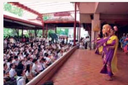
Students watching an outdoor show.